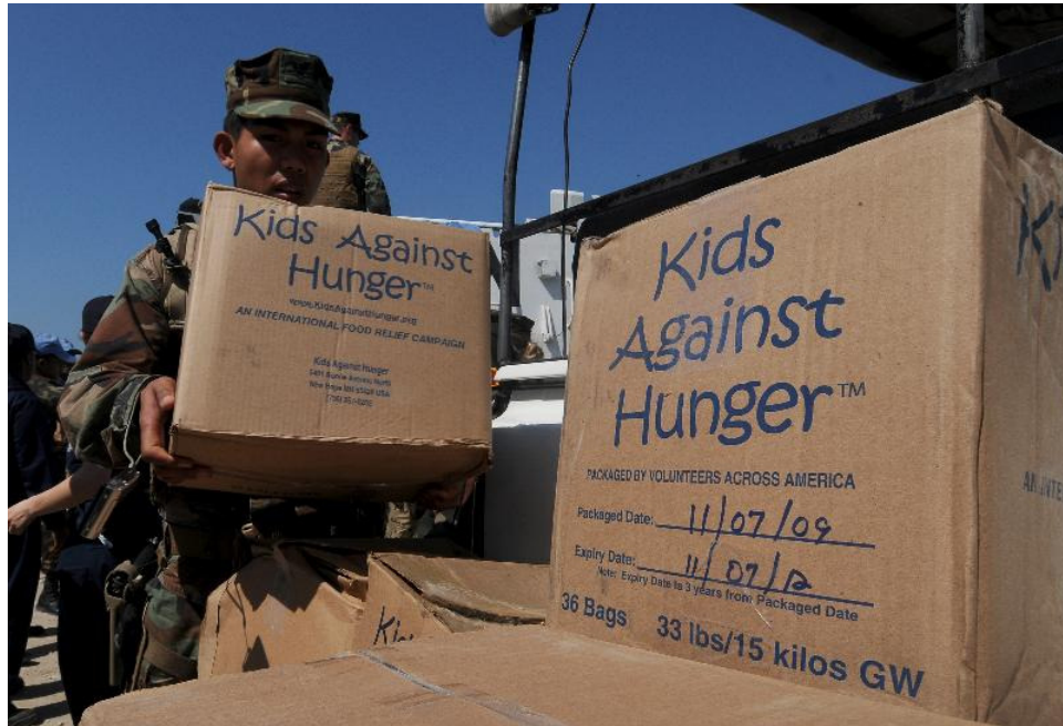
The U.S. Navy is distributing Kids Against Hunger's meals upon arrival in Haiti.