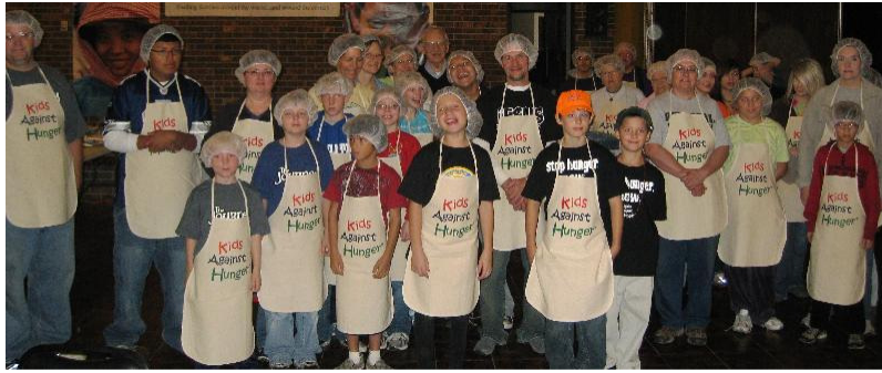
Fun and food packaging in Aberdeen, SD.