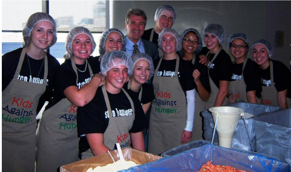
Students from Delano High School packaged over 4,000 meals during our "Building Bridges to a Hungry World" awareness event at the Guthrie Theater and Minneapolis' Mayor R.T. Rybak (center) took time out of his busy schedule to join us for the event!